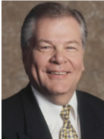
Mayor Patrick Dunlavy

Maybe never before are elections as important as they are now. In light of the total dysfunction of the U.S. Congress and the lack of citizen involvement, our country is truly struggling. That is the reason the local elections are now so very important. Issues that directly affect you, your family, and your neighbors are made in the municipal elections. The direction and shape of your community is made by your local officials.